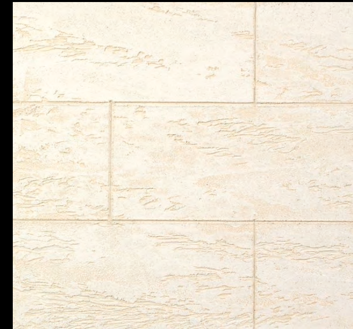
Oleandr Aphid Marble