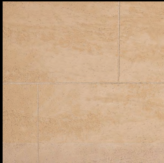
Baltic Amber Marble