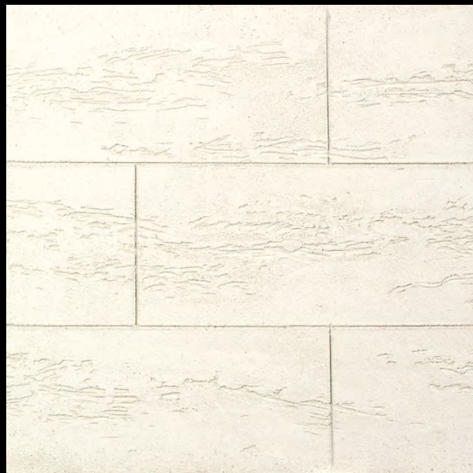
Spider Mum Marble