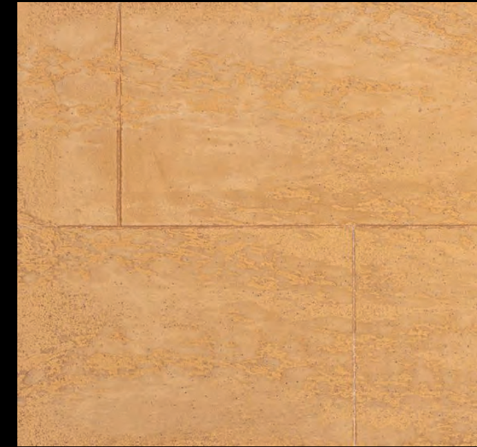
Yellow Agate Marble