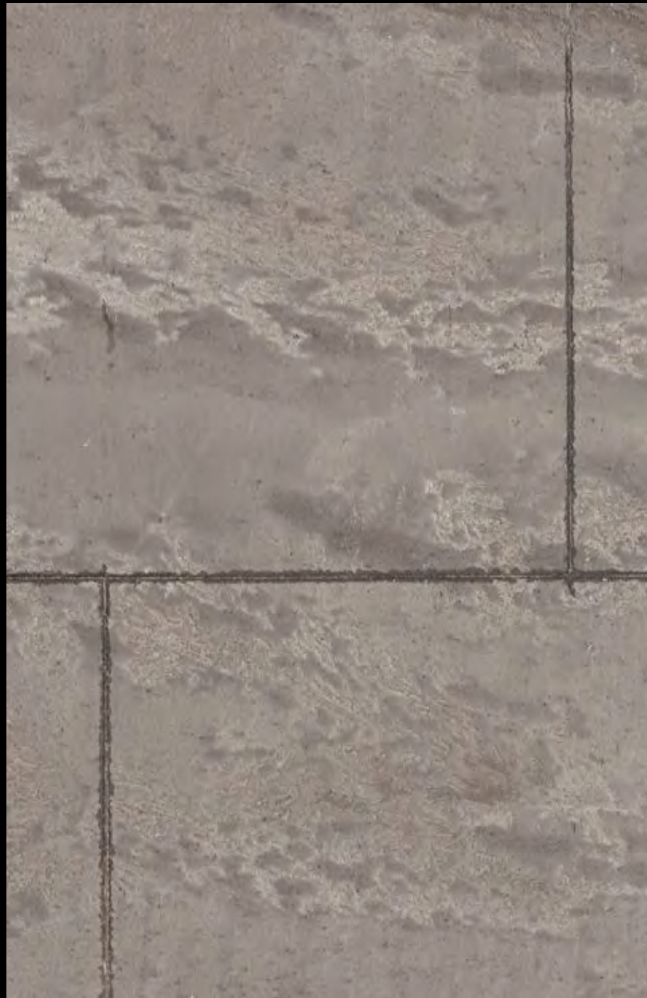
Ash Grey Marble