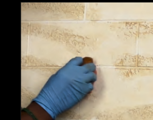
8.Sponge Without Material

Natural Stone Effect: Apply non-coloured MARBILO using the Stainless Steel Trowel, leaving a thickness of about 1.5 - 2 mm. Next, while still wet, run the Brush over the surface, by pressing the bristles on the surface with irregular movements in order to create discontinuous veining. After about 20 - 30 minutes, when the product starts to dry, smooth the surface with the Stainless Steel Trowel with multiple movements and increasing the pressure as the coating continues to dry. Continue until the surface is partially smooth, leaving visible the notches created earlier and the irregular veining. Next, use a pointed tool (i.e. screwdriver) to create the grouting effect of the desired size, typical of the cutstone marble slab. After 24 hours, when the MARBILO is completely dry, apply the first coat of undiluted transparent JN Colour Therapy Clearcoat 80 by using a compact sponge on the smooth surface leaving the veining and notching. After 4 hours apply a second finishing coat of coloured JN Colour Therapy Clearcoat 80, with 50% dilution. After this, while the clearcoat is still wet, remove the excess product on the smooth part using the sponge (which has been washed and well-squeezed), in order to obtain the Natural Stone Effect, due to the different levels of absorption of the surface.