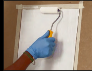
1.JN Speciality Primer