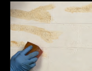
6.JN Colour Therapy Clearcoat 80