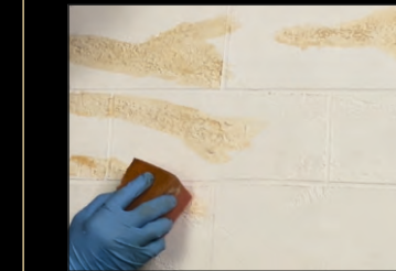
5.JN Colour Therapy Clearcoat 80