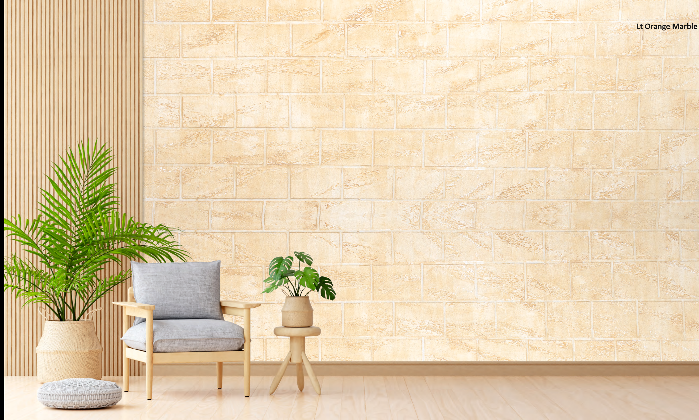
Lt Orange Marble