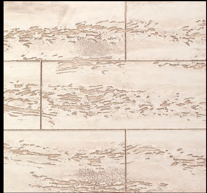
Pine Siskin Marble