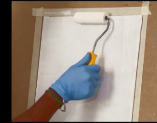
1.JN Speciality Primer