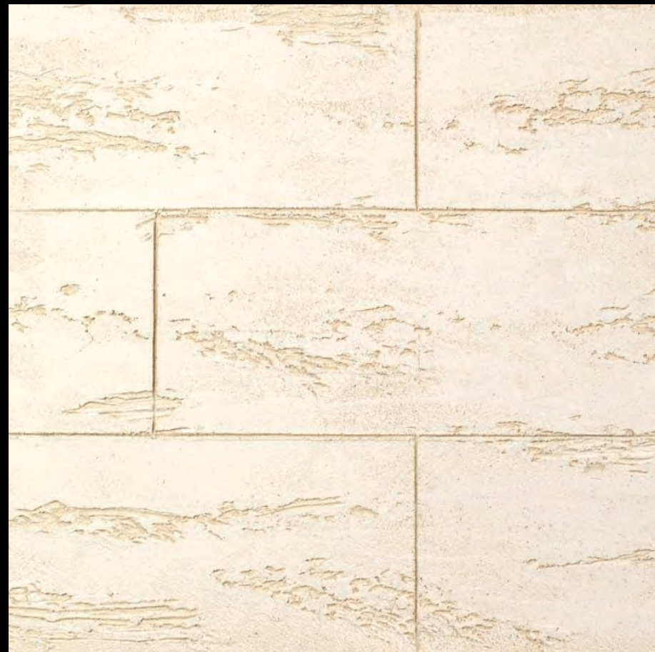
Golden Yellow Marble

3rd Coat: JN Colour Therapy Clearcoat 80