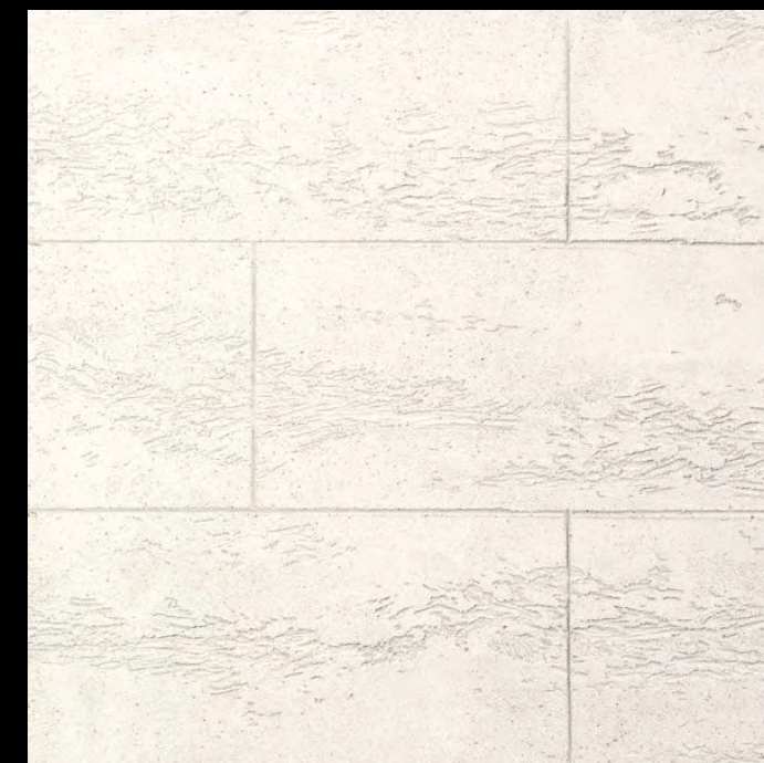
Lt Yellow Pista Marble