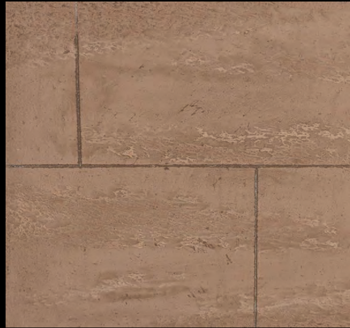
Brown Tumbled Marble