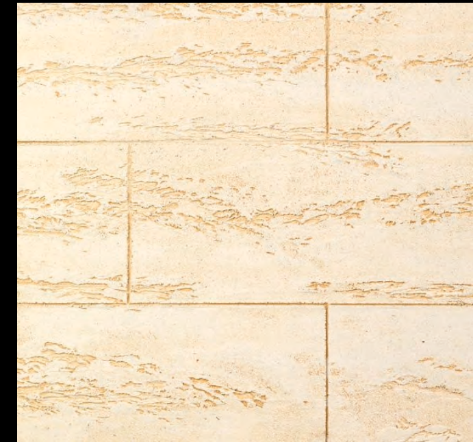
Lt Orange Marble