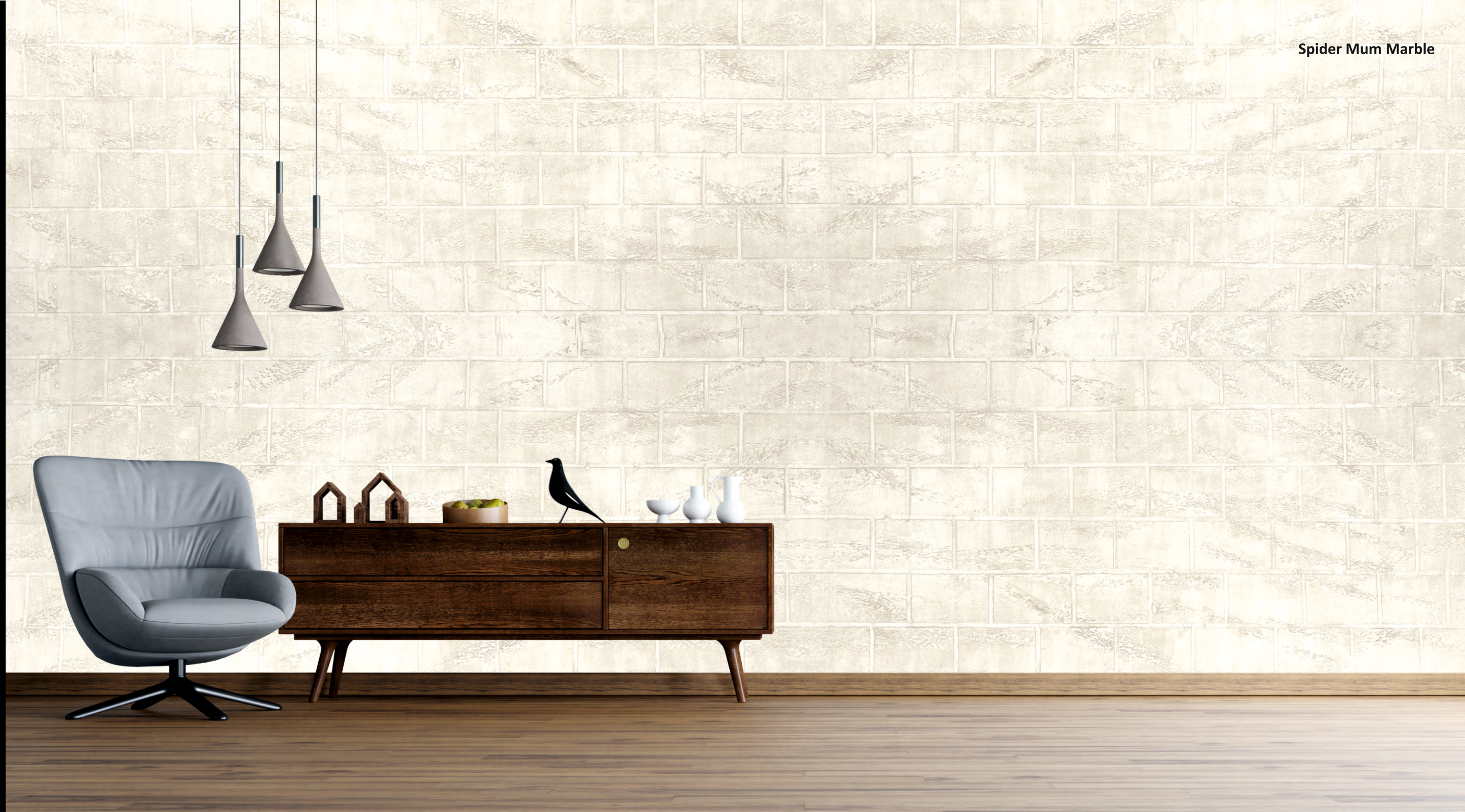
Spider Mum Marble