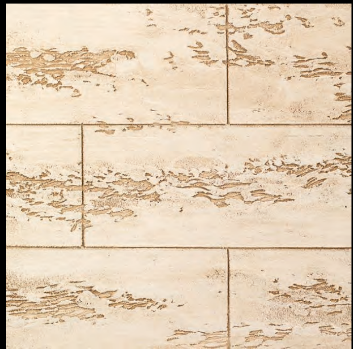
Rutile Quartz Marble