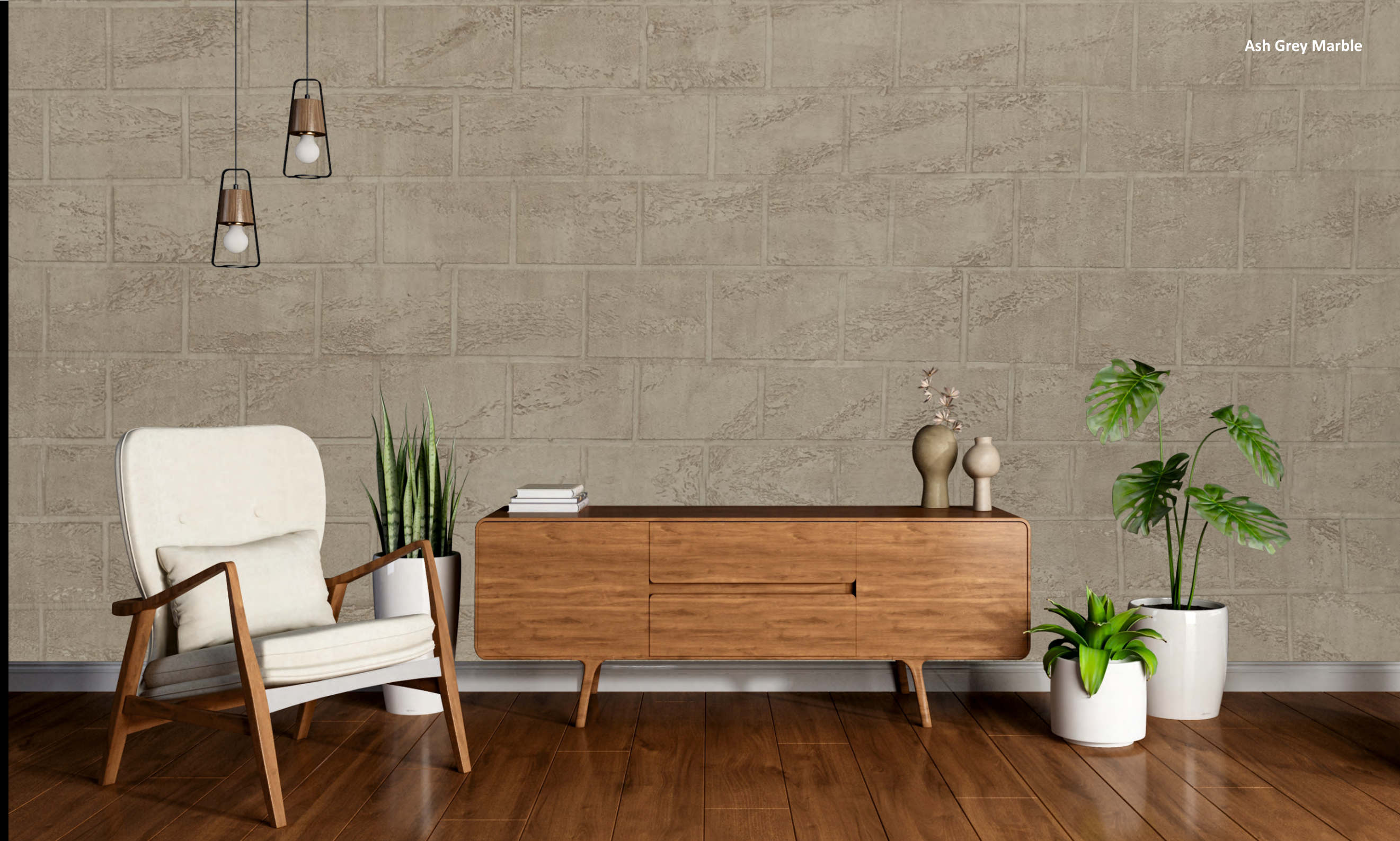
Ash Grey Marble