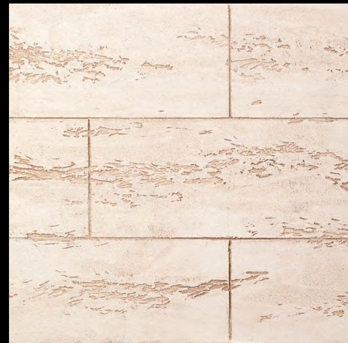
Gold Finch Marble