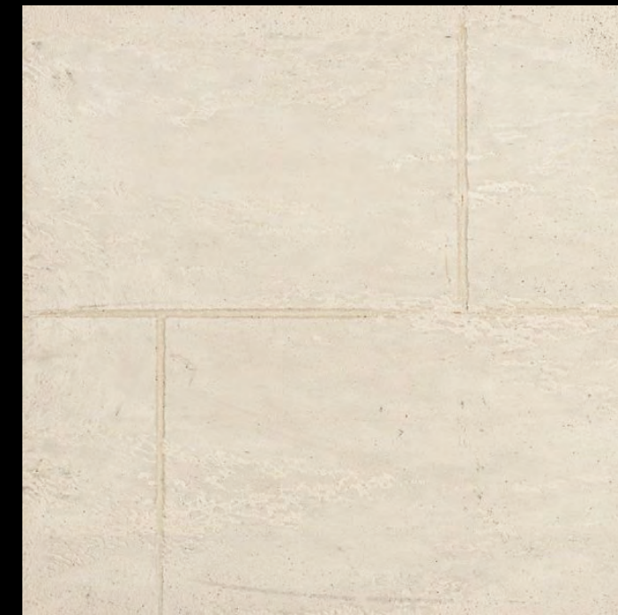
Pineapple Cream Marble