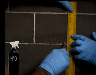
4.Pointed Tools (i.e.Screwdriver)