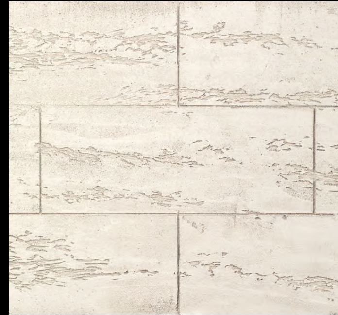
Yellow Throated Marble