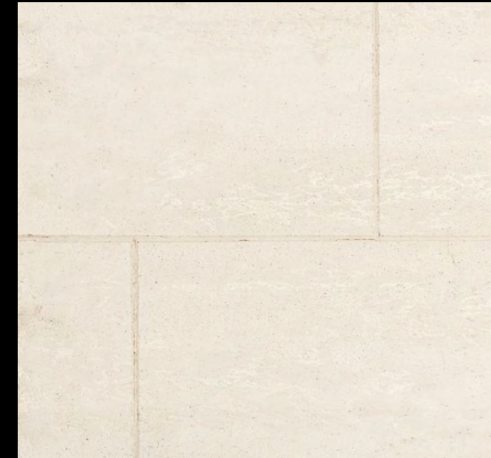
Lemon Chiffon Marble