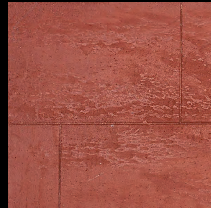
Rhodochrosite Red Marble