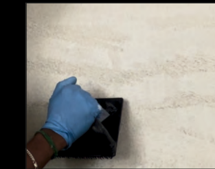
3.Without Material Bristles