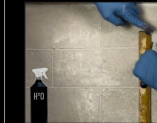
4.Pointed Tools (i.e.Screwdriver)