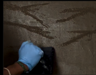
3.Without Material Bristles