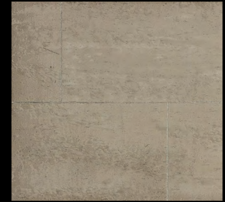
Rm Bidsar Marble