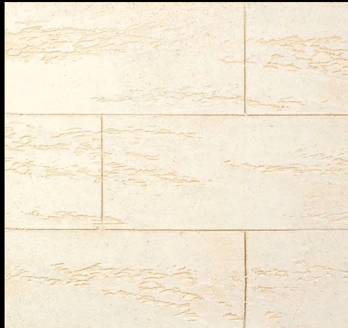
Pearl Yellow Marble