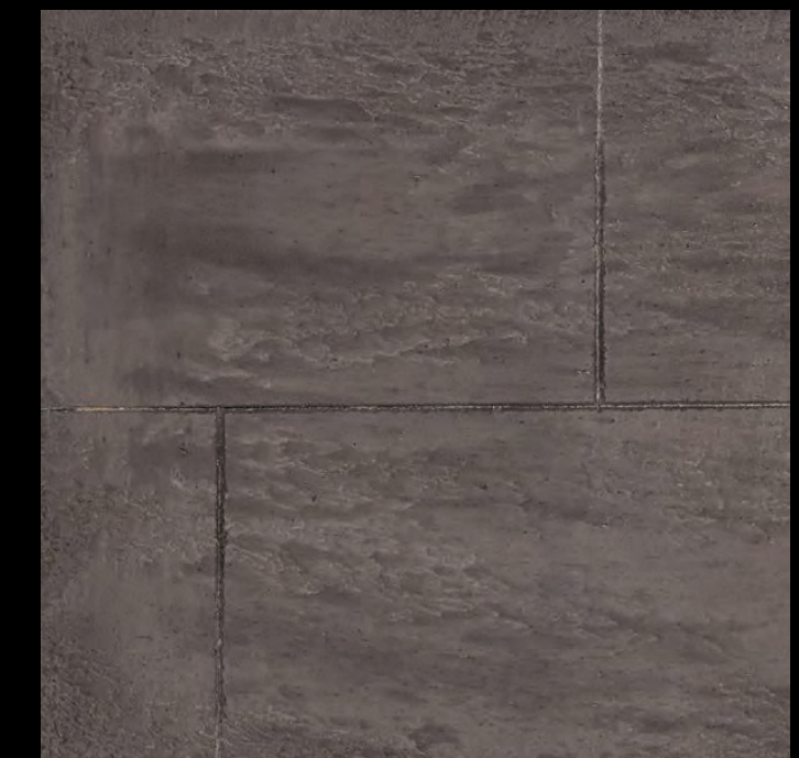
Sandstone Brown Marble